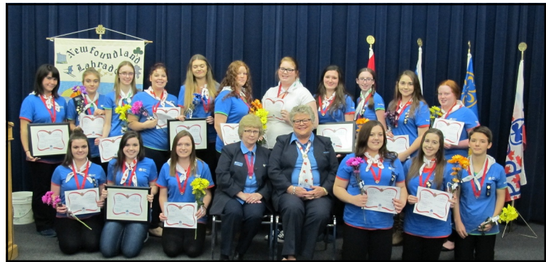
Right: Recipients of the Canada Cord