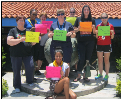
Atlantic Canadian and St. Vincent Twinning leads at the Twinning Conference at Our Cabana - the start of a plan!

Photos: Faces and voices (except the first one) are from our Facebook page; will yours be the next we see?