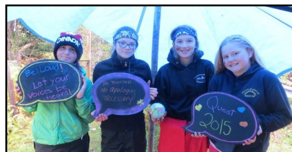
Pathfinders at the NS Quest 2015 Camp:

"Be Loud! Let your voices be heard!" "Be yourself. No apology necessary!"