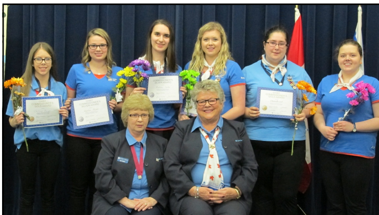
Left: Recipients of the Chief Commissioners Award