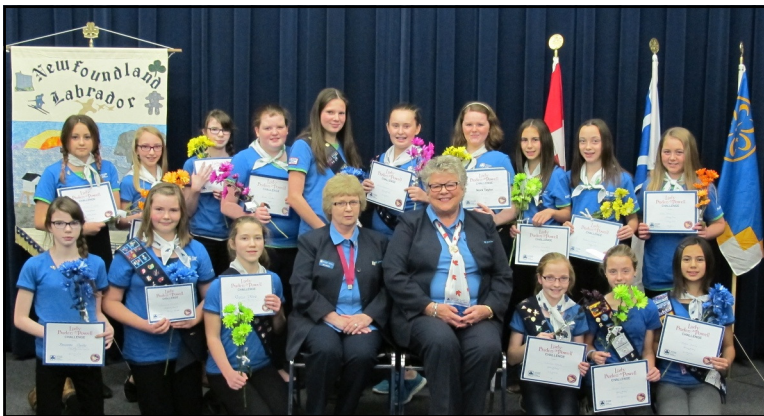
Left: Recipients of the Lady Baden Powell Award.