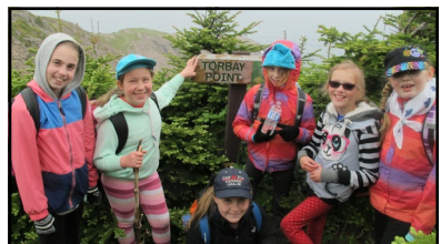
Story and Photos Submitted by Donna Tuck